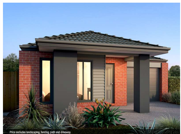
Price excludes landscaping, fencing, path and driveway.

For more information call Gary at Sovereign Rose on 0400390913