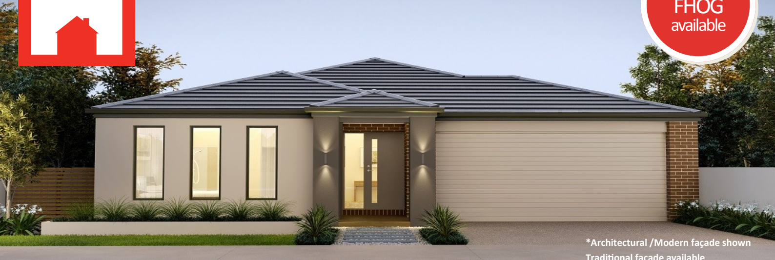
*Architectural /Modern façade shown Traditional façade available